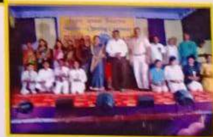
Morning Rays Family, Staff & Winner Students.